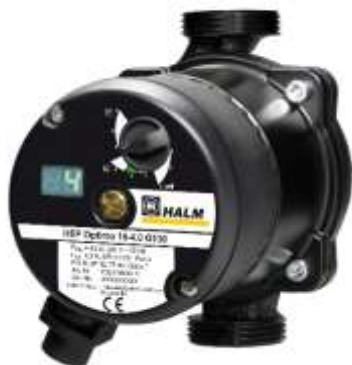
HEP Optimo - Energy "A" (power display) 180