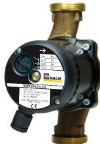
Brass BUPA – DHW 1½" 1½"x 130, 150 &