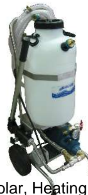
Fillflush - UFH biocide & Solar, Heating Flush, Geoflush