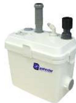
SWH 100– Waste hot water lift pump