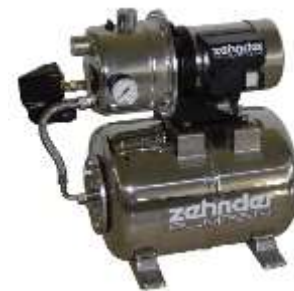
Water Booster sets