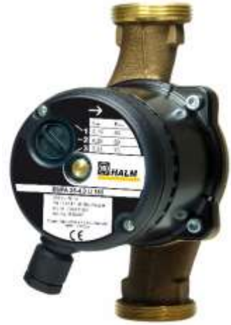
Brass BUPA – DHW 1½" 1½"x 130, 150 &