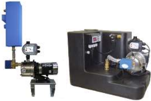
Rain Water Harvesting