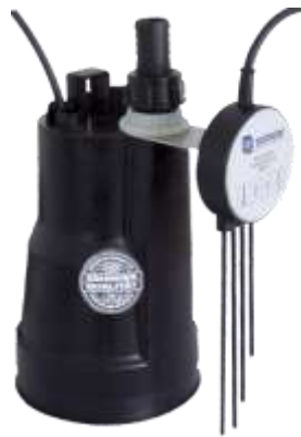
FSP 330 Puddle Pump