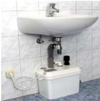
SWH Hot water lift pump