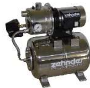
Water Booster sets