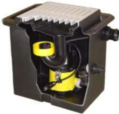
UFB In-Ground Waste water ejection