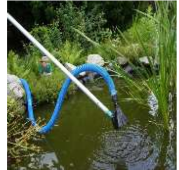
Mud, Silt & oil pumps USS range