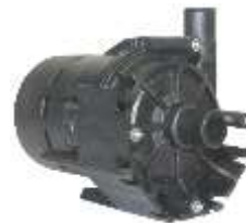
Magnetic Drive Circulation Pump