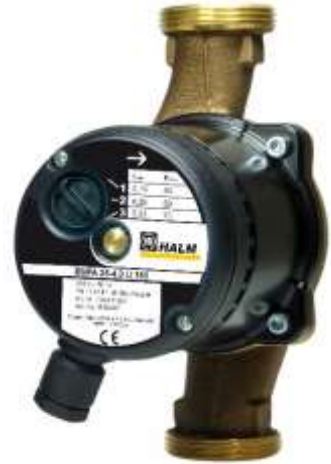
Brass BUPA – DHW 1½" 1½"x 130, 150 &