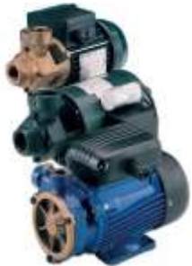
High Head pumps to 80m