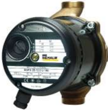
Bronze High Head - BGPA to 12m