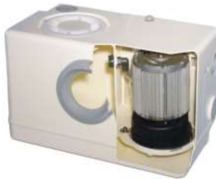
MICROBOY Macerator 160l/m max 10m head max