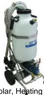
Fillflush - UFH biocide & Solar, Heating Flush, Geoflush