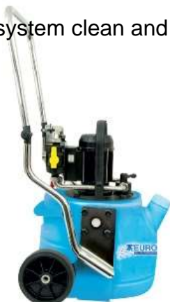
Heating system clean and flush