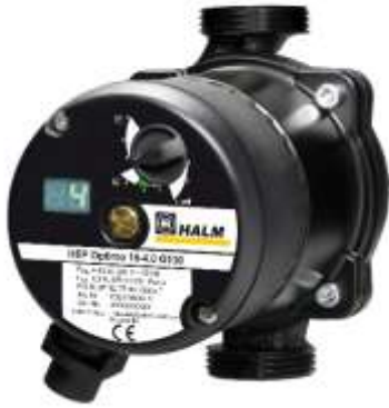
HEP Optimo - Energy "A" (power display) 180